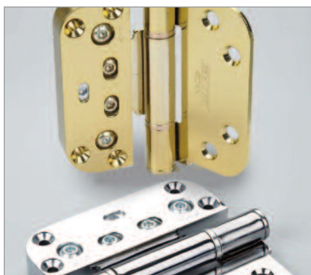
TOP: 4915 3D Adjustable Door Hinges in (left to right) white powder coating, Supercoat 500 and yellow zinc.